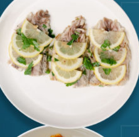
GRILLED FISH FILLETS IN A BUTTER AND LEMON HERB SAUCE