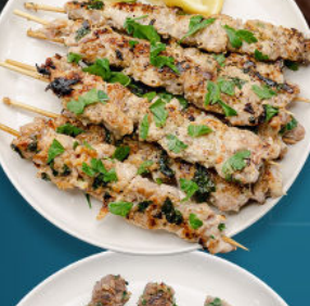
BBQ PORTUGUESE CHICKEN