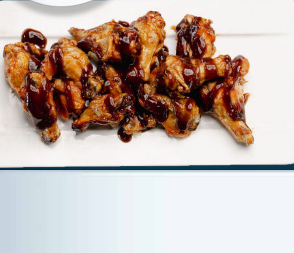
MINI CHICKEN DRUMMETTES