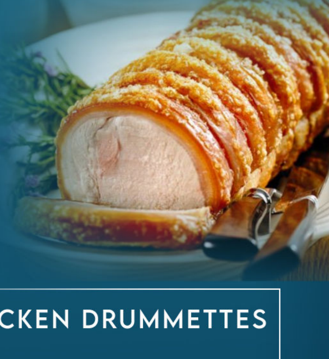
PORK ROLL CARVERY