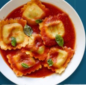
BEEF RAVIOLI IN TOMATO AND CREAM SAUCE