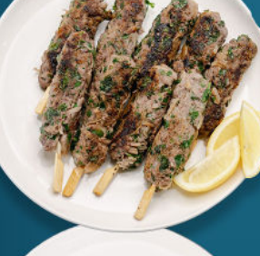
LAMB AND BEEF KAFTA